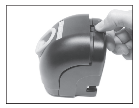
Unplug from the mains and slide the tab on the top to open the splashguard.