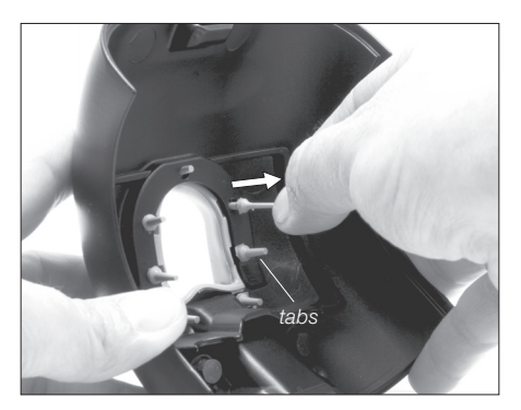
Insert the new one and when the tabs are positioned pull them to secure the gate protector in place.