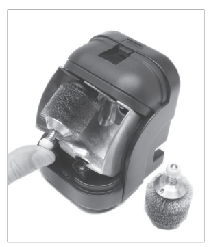
Remove by pulling out the brush at the bottom end.