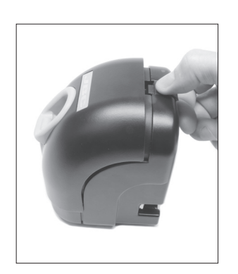
Unplug from the mains and press the tab at the top to open the splashguard.