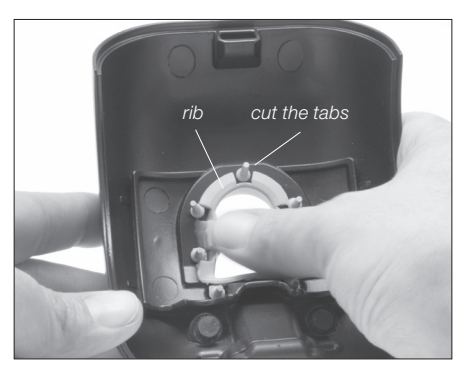
Once in place, cut off the tabs to avoid contact with the brushes.