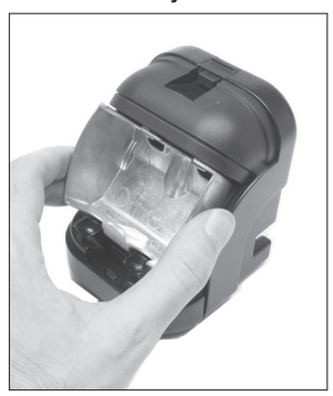
Once cleaned, return the tray followed by the brushes.