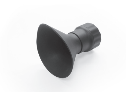
Round Nozzle for FAE Fume Extractor Ref. FAE081

You can replace the supplied nozzle and choose the one that best suits your needs.