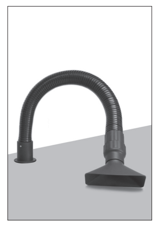
The nozzles are designed to work with the arm suspended and also supported on the work bench.