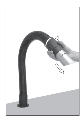
- Turn the nozzle and pull out to remove it.