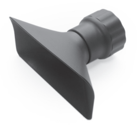
Rectangular Nozzle for FAE Fume Extractor Ref. FAE080