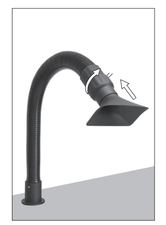
- A bayonet fitting system allows a proper connection between the flexible arm and the nozzle.